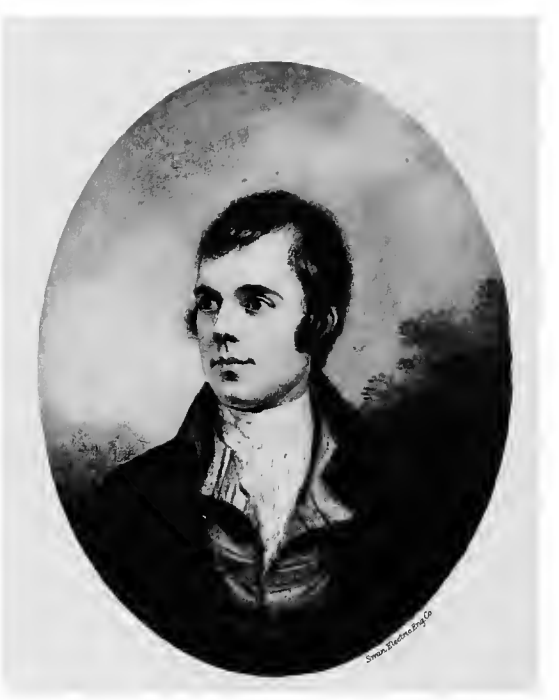
Painted by Alexander Nasmyth: 1787. | The National Callery of Scotland: 15% by 12% rn.)